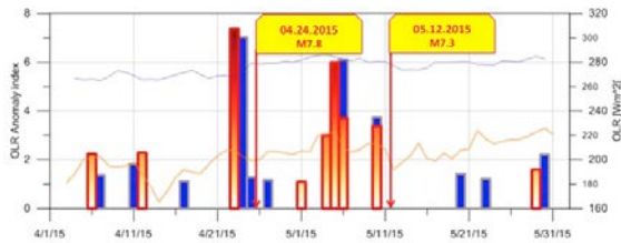
Figure 2. Time series of daily nighttime anomalous OLR for two months over the epicentral regions (box 1°x1°) observed from NOAA/AVHRR (red) and AQUA/AIRS (blue) for the three earthquakes listed in Table 1.