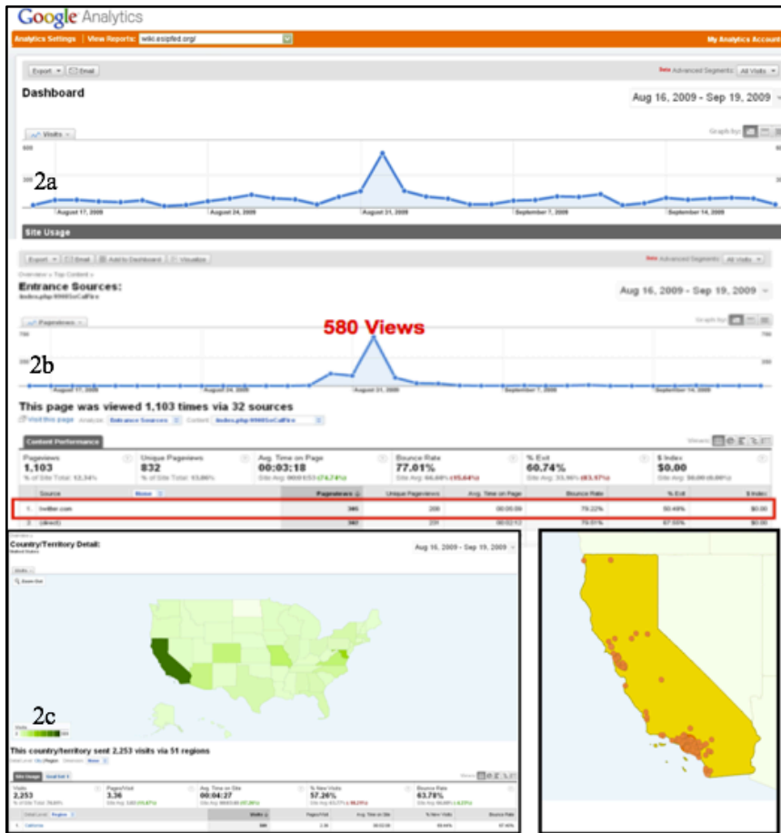
Figure 2a. Entire site traffic for ESIP wiki Aug. 16-Sept.16; 2b. Traffic to SoCal EventSpace driven from Twitter; 2c. Geographic location of traffic.

Future work includes reusing the technologies implemented for the air quality application for other environmental applications, such as drought. Additionally, the current method of identifying events is clumsy and could be improved by some method of georeferencing tweets in order to identify visually geographic hotspots. Finally, the concept of EventSpaces is a work in progress. Improvements are needed to better define relevant content, preserve the pages once the event is over and increase community contributions both from the general public as well as from scientist.