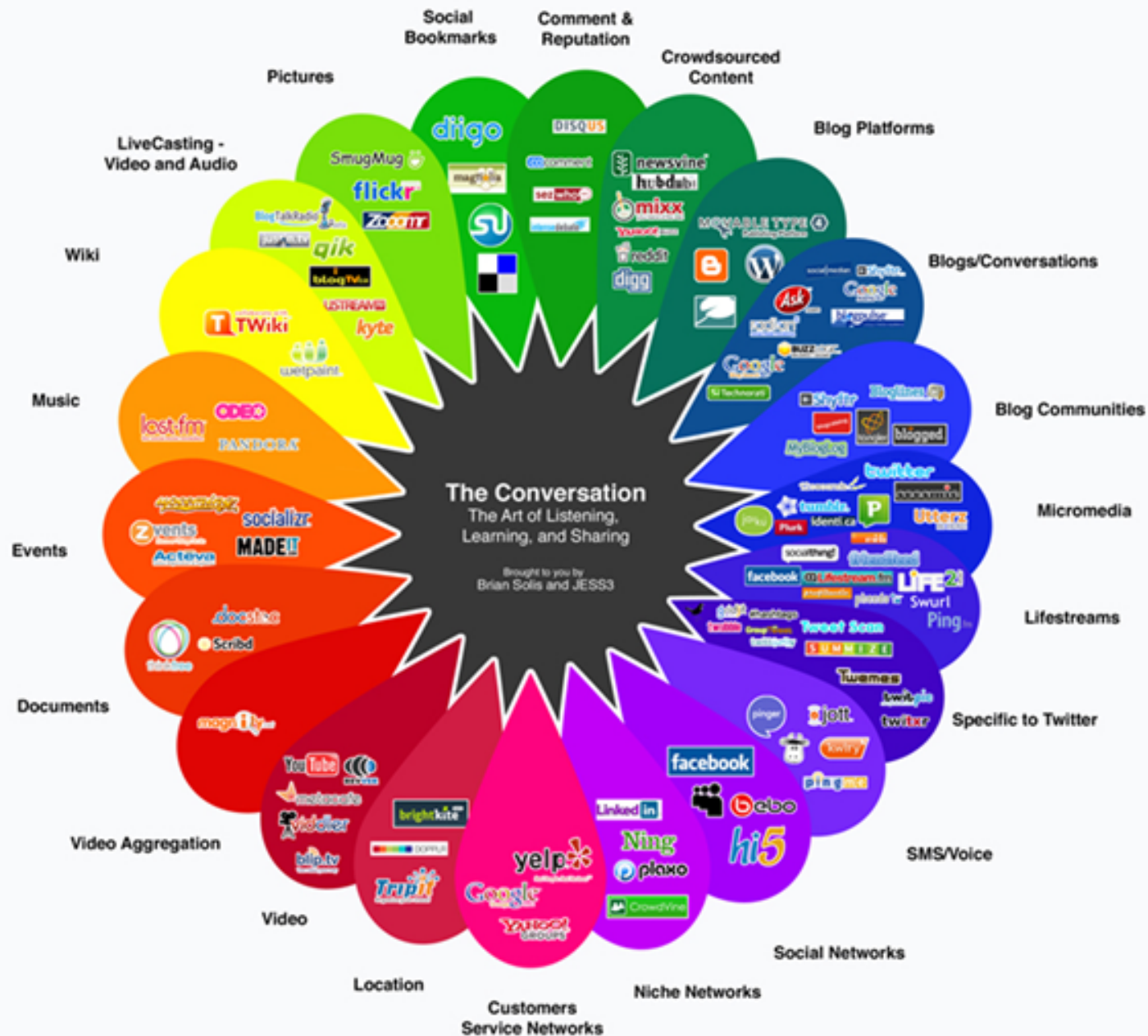
Diagram source: wikipedia