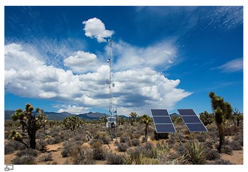
Fig. 1 Typical environmental sensor deployment with science, support, and communication systems. NevCAN Sheep Range Blackbrush station