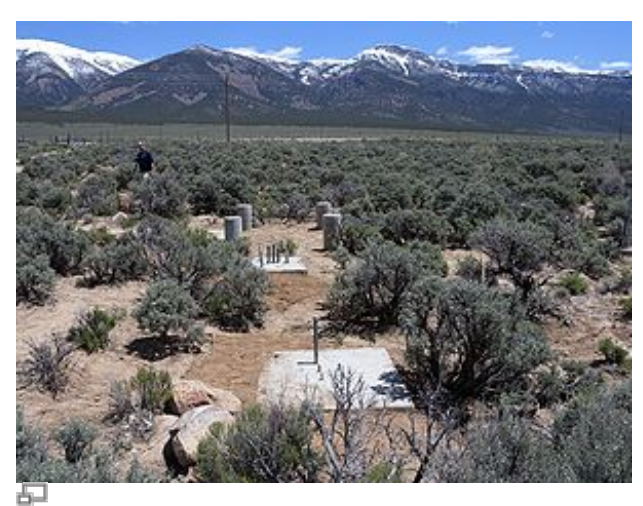
Fig. 5 Carefully planning a site layout in advance can prevent surprises and setbacks during installation.

Site layout at first might seem trivial, but is very important when considering interactions of the various subsystems that can influence sensor/equipment reliability and data quality. Science questions/objectives should drive the placement/separation of sensors to optimize measurement quality, followed by placement of support systems and additional structure. Solar arrays need to be angled for sun exposure, minimal shading, and snow shedding. The impacts of site structure on measurements such as wind eddies, incoming/outgoing radiation, camera viewsheds, or precipitation catch zones need to be considered as well as aesthetic impacts if located in a region that is frequently visited by the public. Power and data cable runs should be protected and kept as short as possible; voltage drop over long runs can be a consideration in layout and design. Stipulations in site permits may be drivers of site layout and construction. Once the site layout is designed and mapped, specification of construction materials, sensor cables, and other supplies may be optimized.