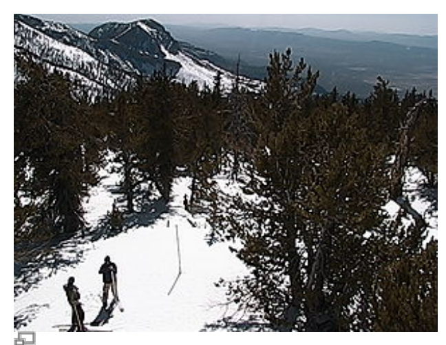
Fig. 3 Seasonal access may vary highly depending on location, limiting the types of maintenance possible at any given time.

Locations for in-situ sensing must be accessed for data collection, survey, construction, and maintenance over the life of the project. Seasonal conditions, roads, and topography determine what types of access may be used during different times of the year. Categorical considerations include: