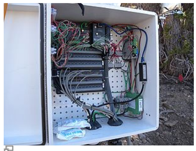
Fig. 4 Science instrumentation specification must be driven by science questions and